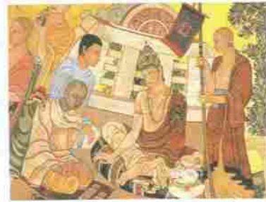
The Gupta King, Chandragupta-II