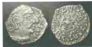
Silver Coins of Chandragupta-II Reign