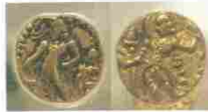
Gold Coins of Chandragupta-II Reign