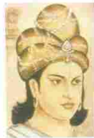
Ashoka, the Great

History enables us to know about the kings and statesmen as well as ordinary people of different times.